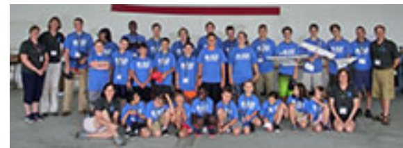
Class of 2019, Week 2 Laconia Airport, NH